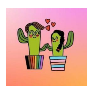
Figure 1: (Instagram Pride Stickers 1, Kompasiana.com)

the LGBTQ and Global communities. <sup>3</sup> The visual contained in this sticker depicts a pair of captus holding each other and jumping very happily, this is also related to the feeling of joy and what they have as LGBTQ people. The aim and purpose of the Pride sticker in the Instagram story is to support the celebration of the month of LGBTQ community activist volunteers. <sup>4</sup>