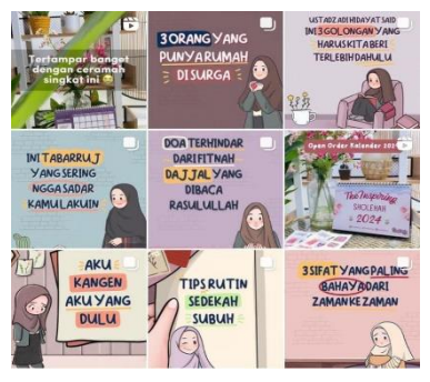
Figure 2. Instagram Account Post View @sholehahstory

@sholehahstory Instagram account provides a great opportunity for its followers to give comments, as well as messages that they want to convey in the form of venting personal problems, friendship problems and others. The posts presented by the Instagram account @sholehahstory are studies that show daily life such as manners, tips, daily doa and various kinds of self-motivations related to increasing enthusiasm in achieving happiness in this world and the hereafter. Every post uploaded to @sholehahstory social media account often gets a lot of likes and positive comments from its followers.