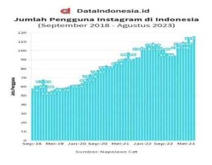
Figure 1. Active users of Instagram social media

Instagram users come from all elements and segments of society without any difference in social class. All Instagram users mingle with each other.